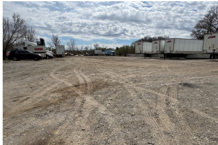
Back West Lot