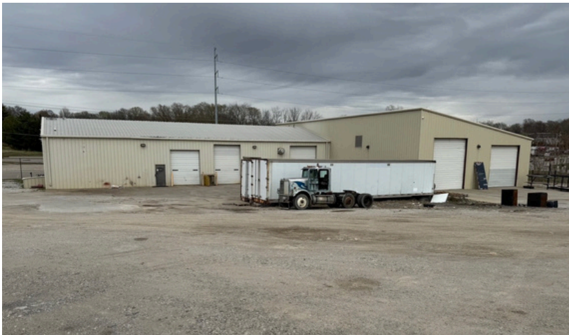
Back of Building