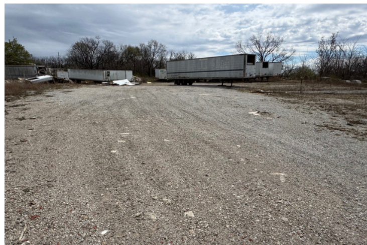
Back East Lot